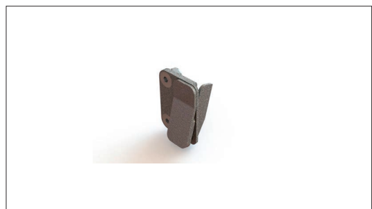
111-00144 Interval locking optional height.