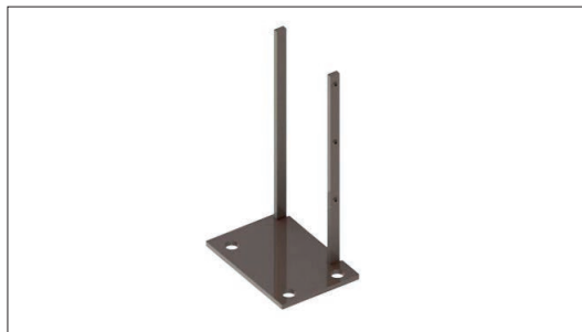
111-00131 Bolted insert foot. Set of 2 pcs.