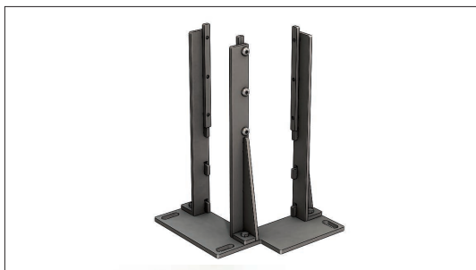
111-00238 Corner Clamping foot. 1 pcs.