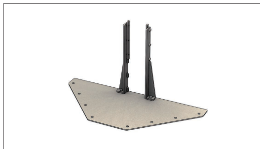
111-00237 Town square foot. Set of 2 pcs.