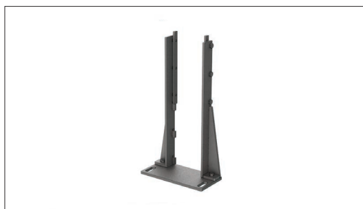
111-00233 Clamping foot. Set of 2 pcs.