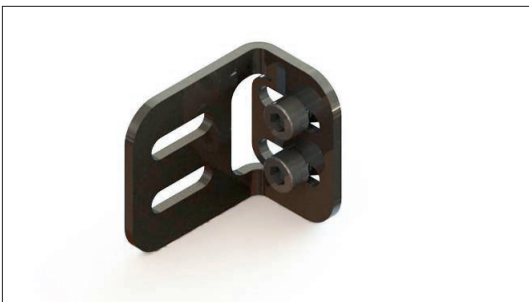
111-00123 Angled connection plate for attachment against post/wall. Set of 2 pcs.