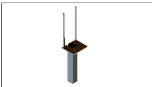
111-00132 Box insert foot. Set of 2 pcs.