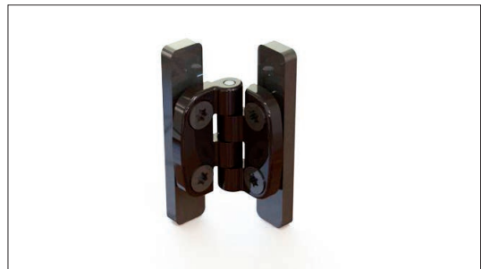
111-00127 Hinge for corner other than 90°. Set of 2 pcs.