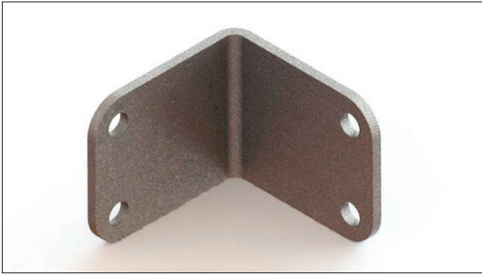
111-00121 Corner connection plate 90°. Set of 2 pcs.