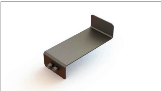
111-00125 Z connection bracket for attachment against existing railing. Set of 2 pcs.