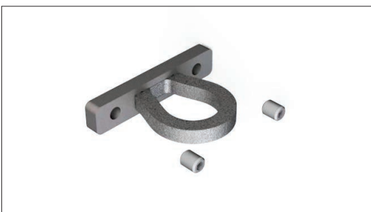
111-00142 Lock shackle. Set of 2 pcs.