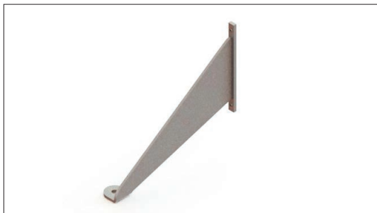
111-00130 Standard foot. Set of 4 pcs.