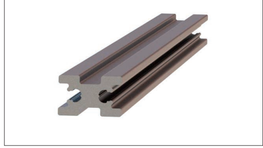
111-00124 Connection strip for attaching sections together.