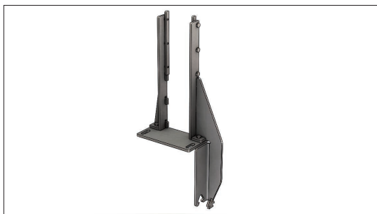
111-00235 Foot for balcony. Set of 2 pcs.