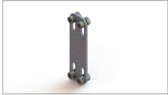
111-00122 Straight connection plate for attaching sections together or against post/wall. Set of 2 pcs.